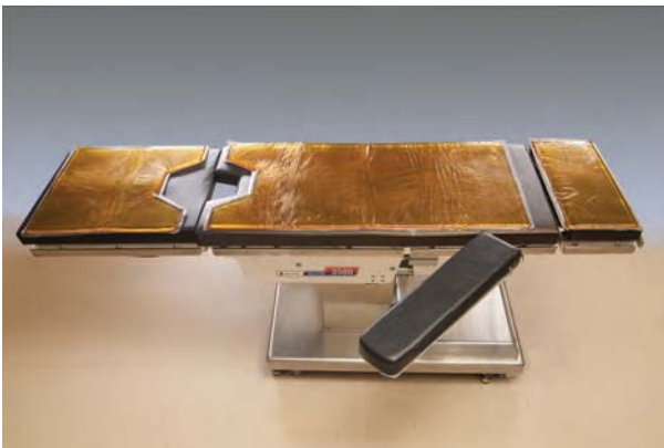
Part # TZ-GELFT3