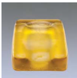
Part # TZ-GELSHP