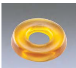
Part # TZ-GELPD