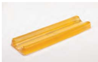
Part # TZ-GELAC