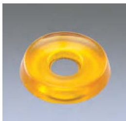
Part # TZ-GELDA