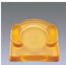
Part # TZ-GELHDP