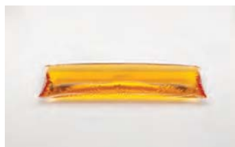
Part # TZ-GELPP14