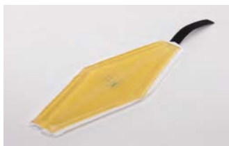
Part # TZ-GELUPS