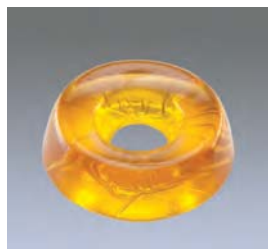
Part # TZ-GELDA-3