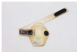
Part # TZ-GELHP