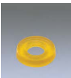
Part # TZ-GELND