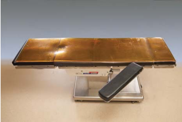
Part # TZ-GELFT