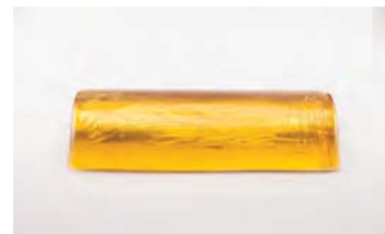
Part # TZ-GELCR6-16