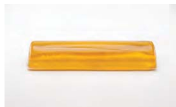
Part # TZ-GELCR4-16