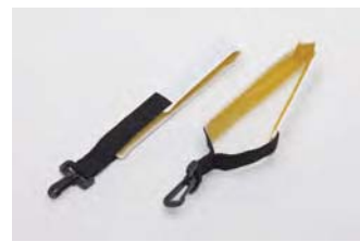
Part # TZ-GELAS