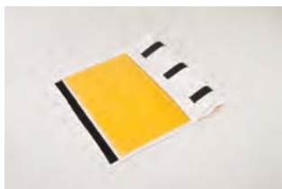
Part # TZ-GELUPL