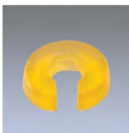
Part # TZ-GELHRS