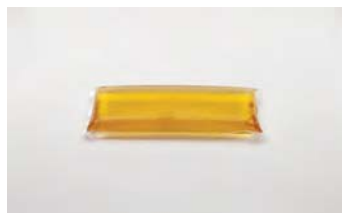
Part # TZ-GELPP10