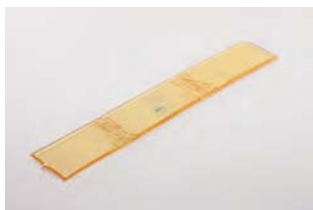
Part # TZ-GELAF