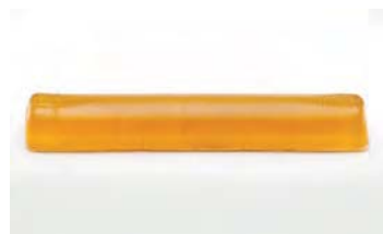
Part # TZ-GELCR4-20