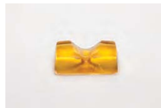
Part # TZ-GEL-HC