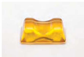
Part # TZ-GELCC