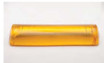
Part # TZ-GELCR6-20