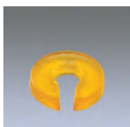
Part # TZ-GELPHR