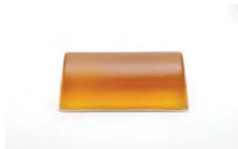
Part # TZ-GELCR6-12