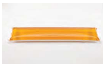
Part # TZ-GELPP18