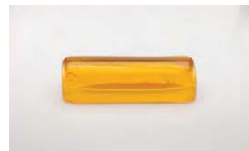
Part # TZ-GELCR4-12