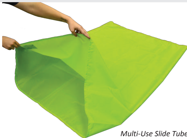
Multi-Use Slide Tube TZ-MU-58X40 Single Use Slide Tube TZ-ST-58X40

Safely and efficiently conduct lateral patient transfers without sacrificing patient comfort.