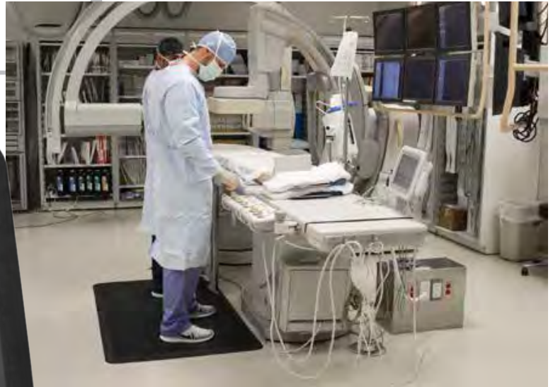
Reduce injuries while improving productivity and safety